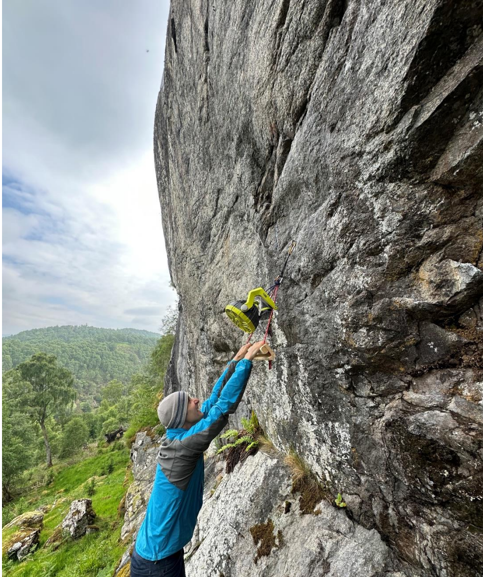
Wilby embracing modern crag tactics.