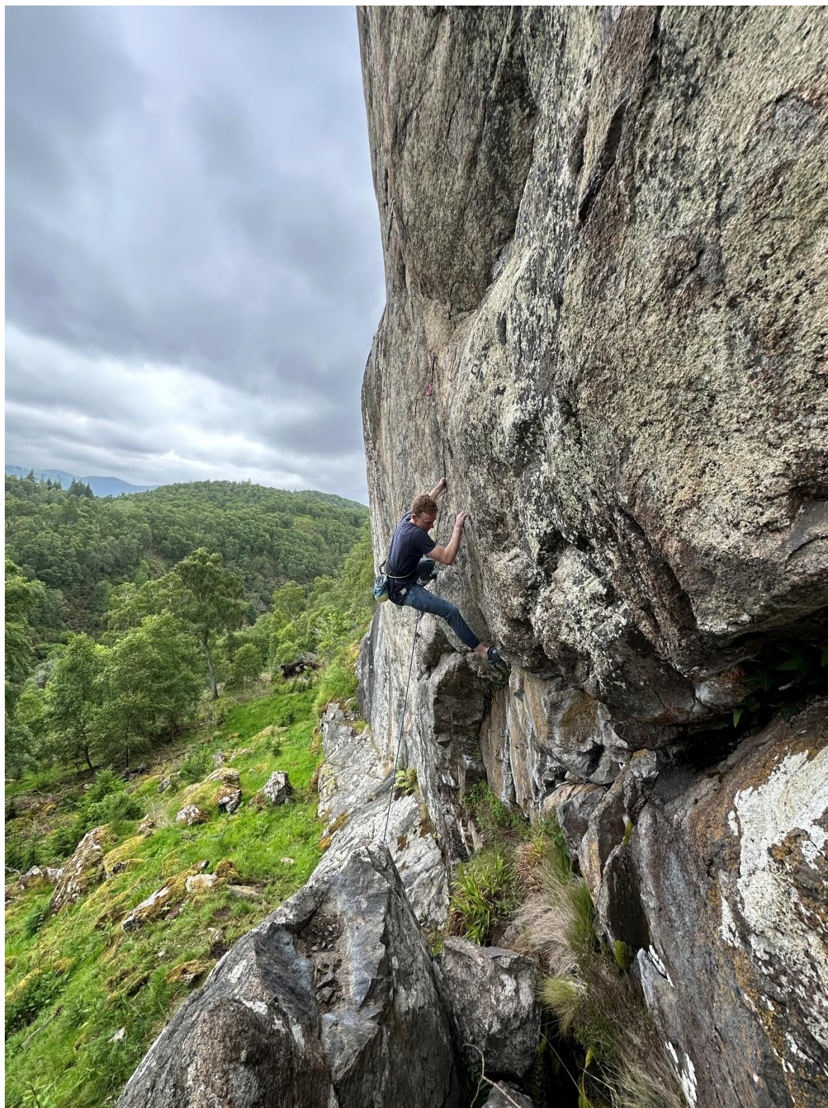
‘Bird of Prey 7b’